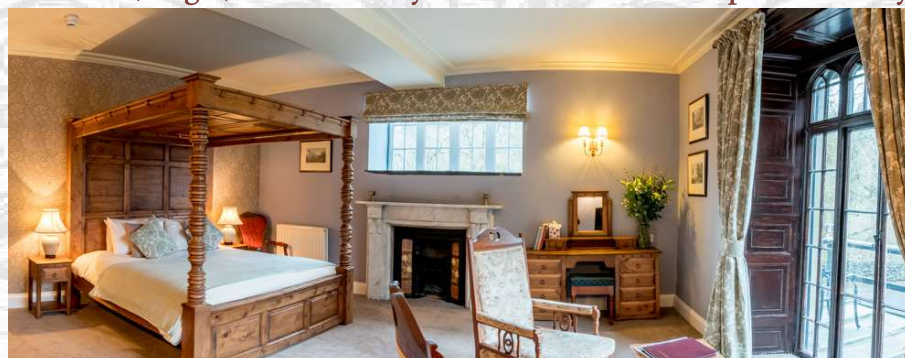
Four posters - very romantic