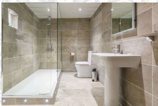
Double, single, twin & family rooms

DON'T GO - WE HAVE LOVELY B&B ROOMS TOO!